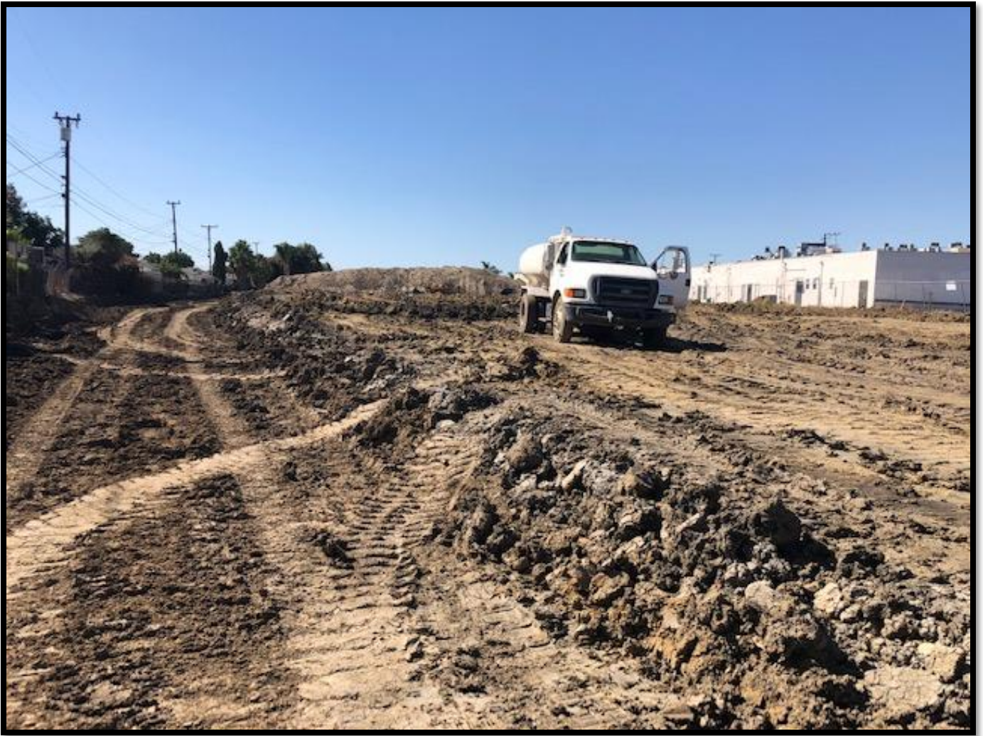
Starting to cut streets. Will leave 2' low to accommodate spoils.