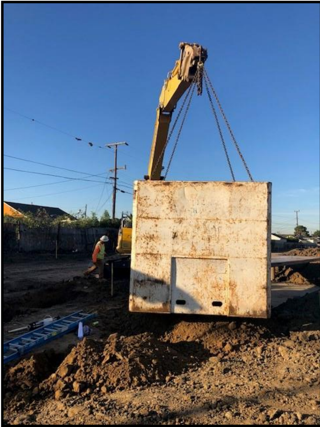
Getting sewer manholes ready