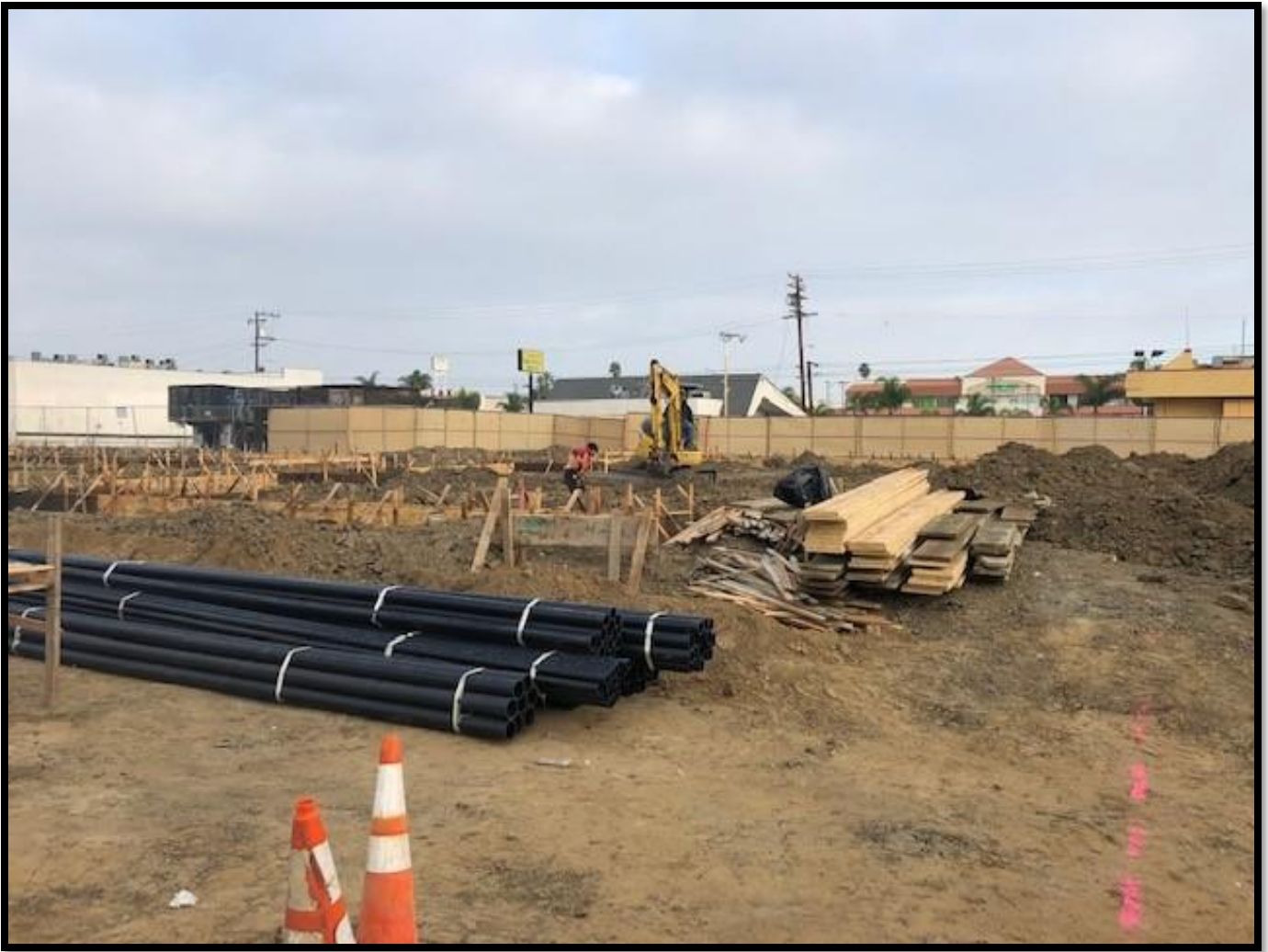
Starting ground plumbing