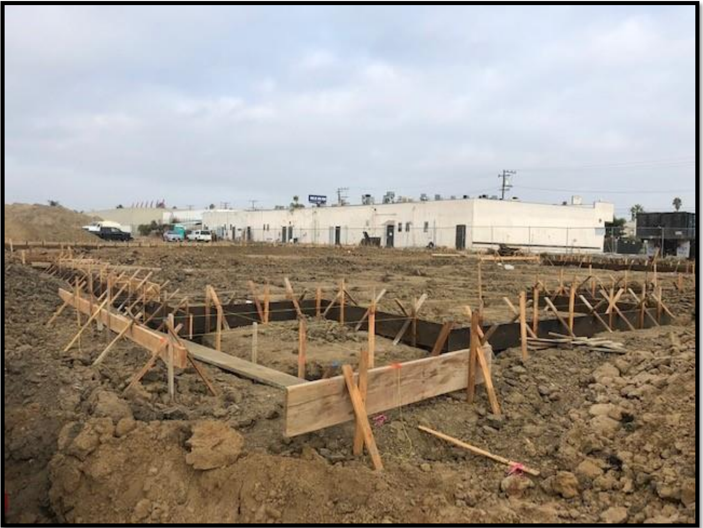
Setting building forms