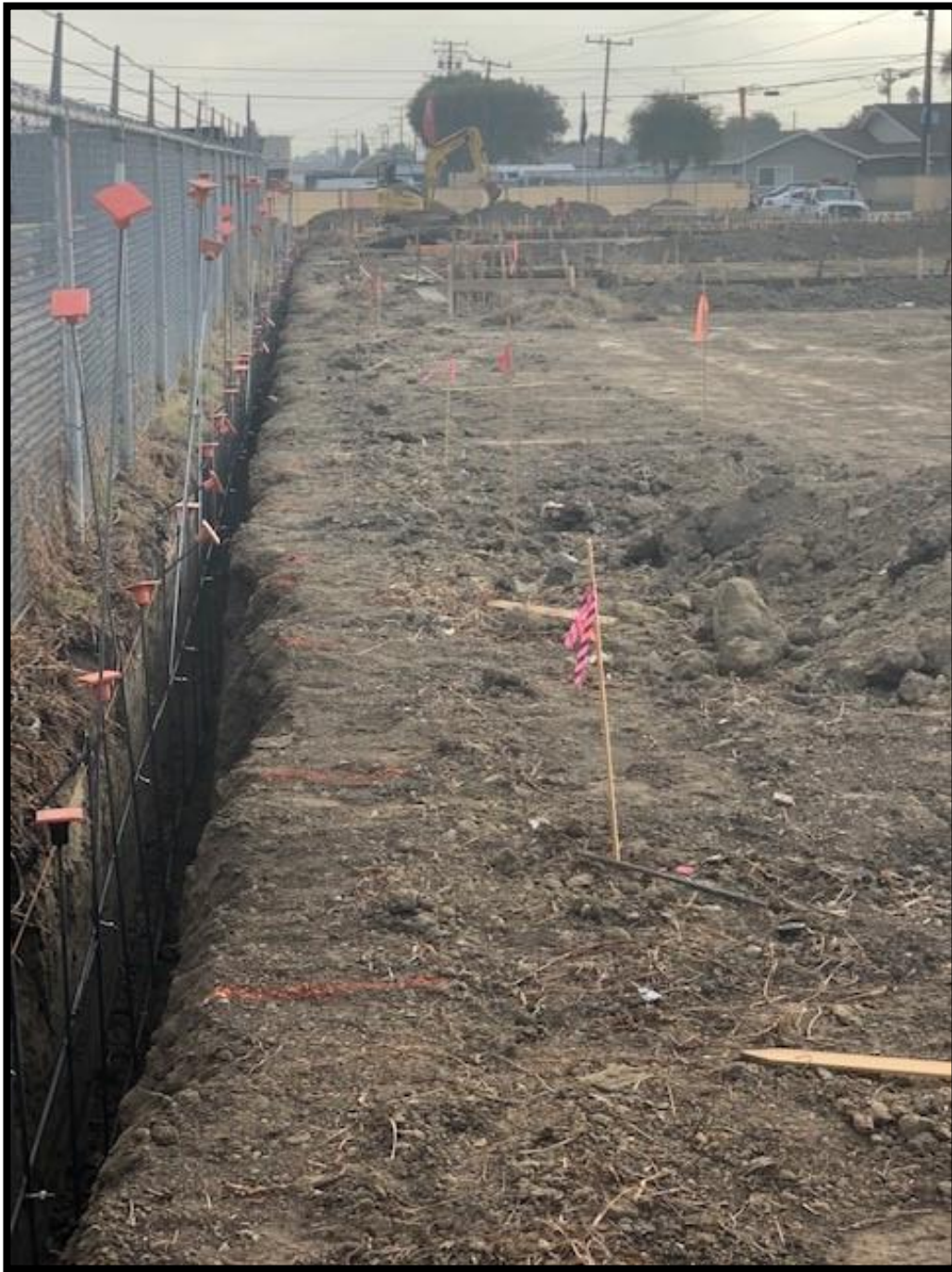
Ready for wall footing inspection