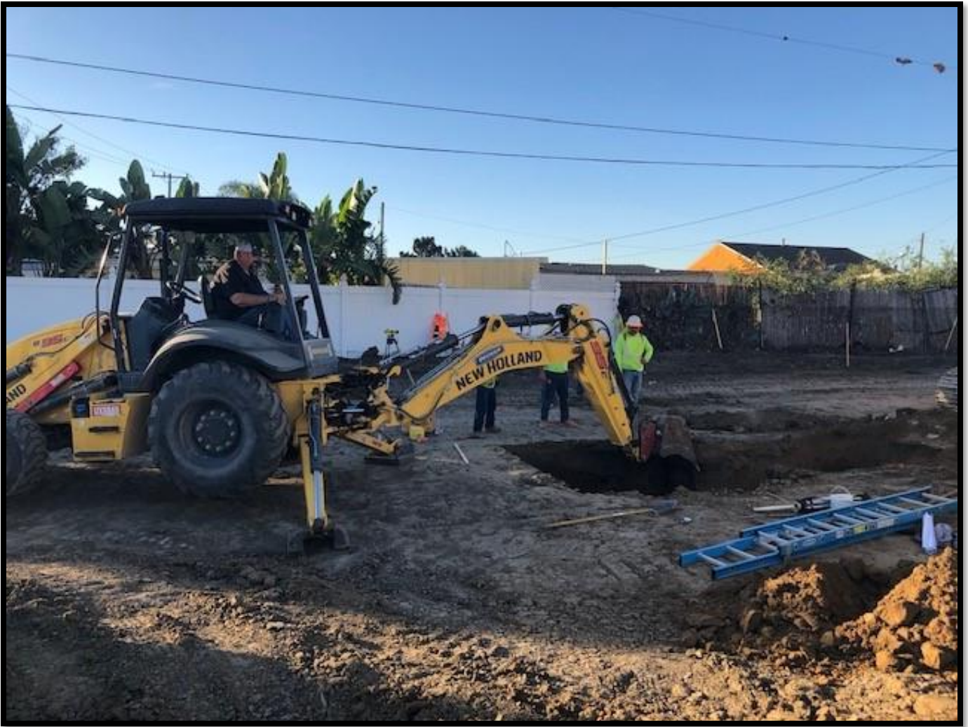
Digging sewer manholes